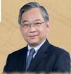
副总理 颜金勇 长老