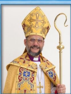
主题讲员： 东南亚教省大主教 暨新加坡教区主教 章剑文大主教(博士)